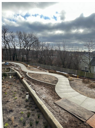
Construction on our garden is well underway! Garden beds will